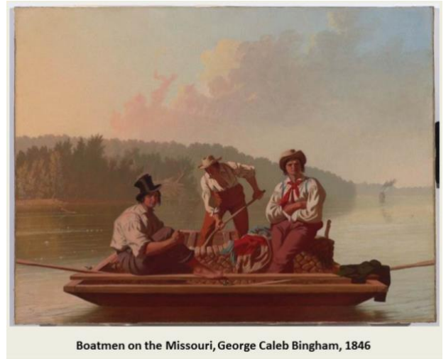
Boatmen on the Missouri, George Caleb Bingham, 1846

Join us for a virtual tour of the permanent collection at the DeYoung. We will highlight 3-5 paintings in the de Young's American Art collection that are quintessentially American. The tour will begin with a brief interactive slide show to demonstrate how ingrained the European sensibility for style, technique and subject matter is for many American artists of the 17 th through early 20 th centuries. Then we will dig into the specifically selected works that have a unique American character and chat about what we see that makes them so.