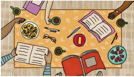
Chinatown by Charles Yu.